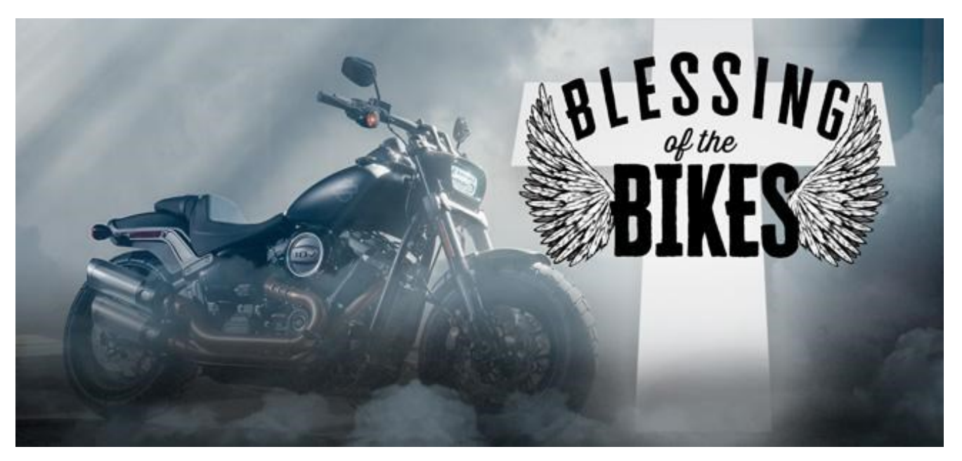
Blessing Of The Bikes

April 30, 2023 1:00pm American Legion 903 W. Superior Jacksonville, IL After the blessing we have planned a short ride, maybe to Quincy and eat somewhere. So plan on getting your bike blessed, enjoying a ride and bring